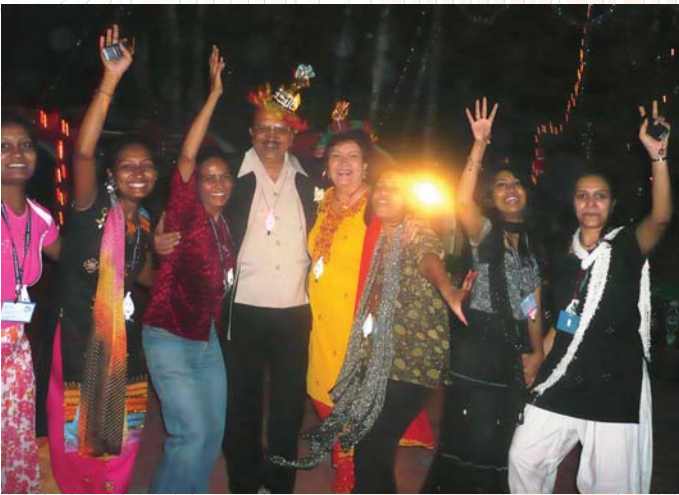
LPF celebrates 2008 New Year Party at Filli Villa