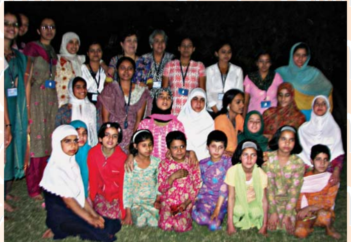
LPF meets young Kashmiri girls