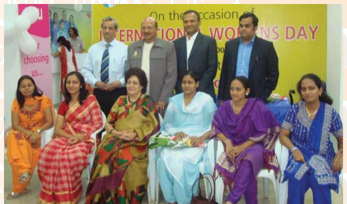
Dass Electronics Felicitation to 5 Lila Fellows on the occasion of International Women's Day