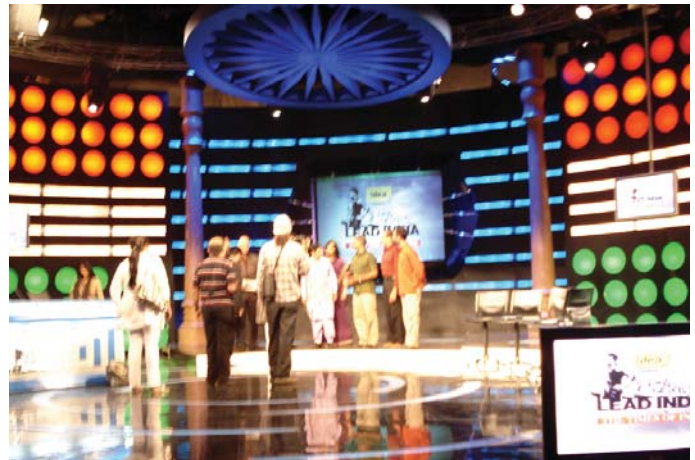
The Lead India Campaign set